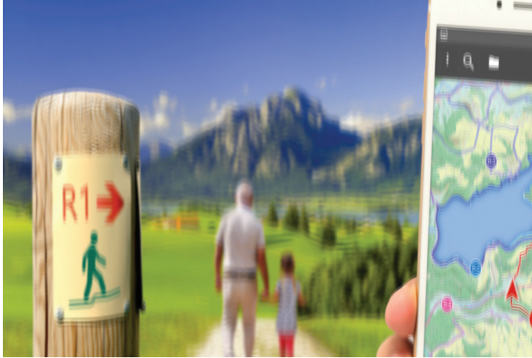
With presbyopia and astigmatism

Other solutions include prescription glasses and contacts made for astigmatism or an additional surgery