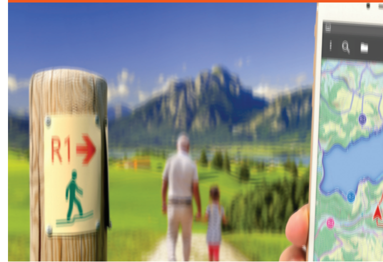
With presbyopia and astigmatism

Other solutions include prescription glasses and contacts made for astigmatism or an additional surgery